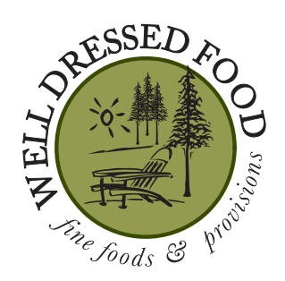
Thursday: Pizza! Select any Well Dressed Flatbread Pizza (or build your own) and receive a second for 50% off!